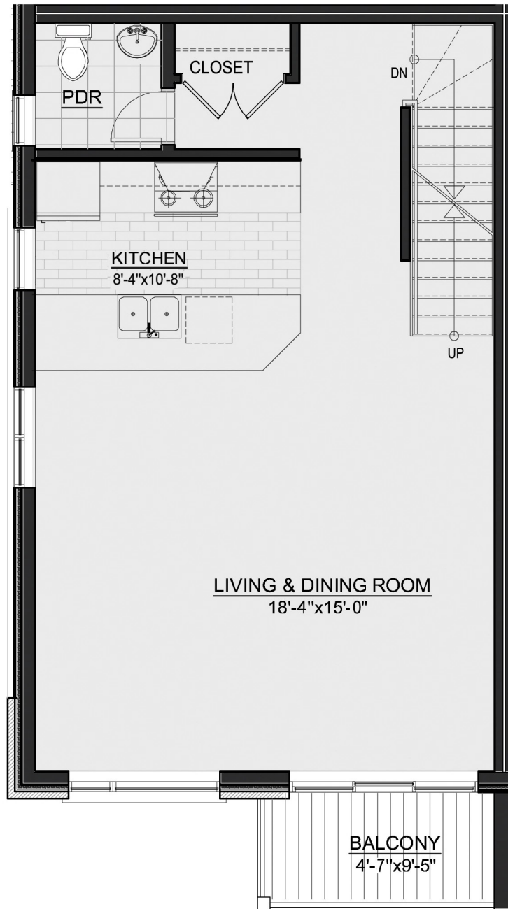
SECOND FLOOR AREA: 695 sq. ft.