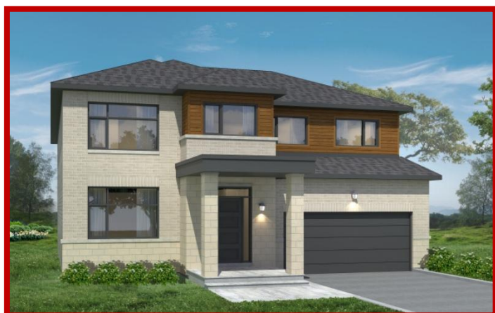
House is as built and may differ slightly from this image